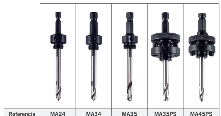
Referencia MA24 MA34 MA35 MA35PS MA45PS